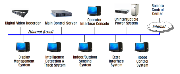
Fig. 2 Equipments for the main control system