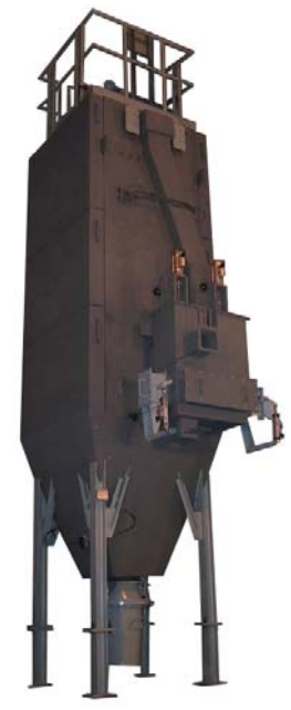
Figure 3 Equipment filtration/adsorption (SCR)

Filter contains 15 filter bags with a diameter of 152 mm and is 2,500 mm long. Two replaceable modules are on the each side of the filter. These modules can be adapted for adsorption process of waste gas, or for storage of a catalyst for selective catalytic reduction NO_X (SCR). Area of adsorption