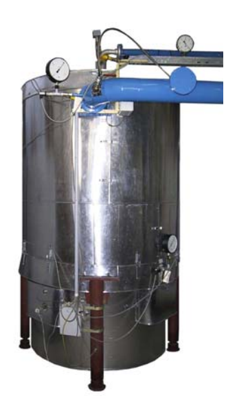
Figure 1 Compact equipment

The equipment consists of three main parts – cylindrical combustion chamber, catalytic reactor and coaxial heat exchanger, these parts are integrated into one equipment. Preheating of waste gas provides the special heat exchanger, which consists of several concentric cylindrical plates. Flue gas from the combustion chamber (catalytic reactor) and waste gas (which is heated by flue gas) spiral flow in the spaces between these plates. Thanks to this solution good effectivity of heat exchange is achieved. Thermal/catalytic oxidation of gas waste cylindrical proceeds in combustion chamber/catalytic reactor. The combustion chamber is placed inside the coaxial heat exchanger in its axial axis and the catalytic reactor is placed below the combustion chamber. Therefore the equipment is very compact – the combustion chamber, catalytic reactor and heat exchanger are concentrated in small volume.