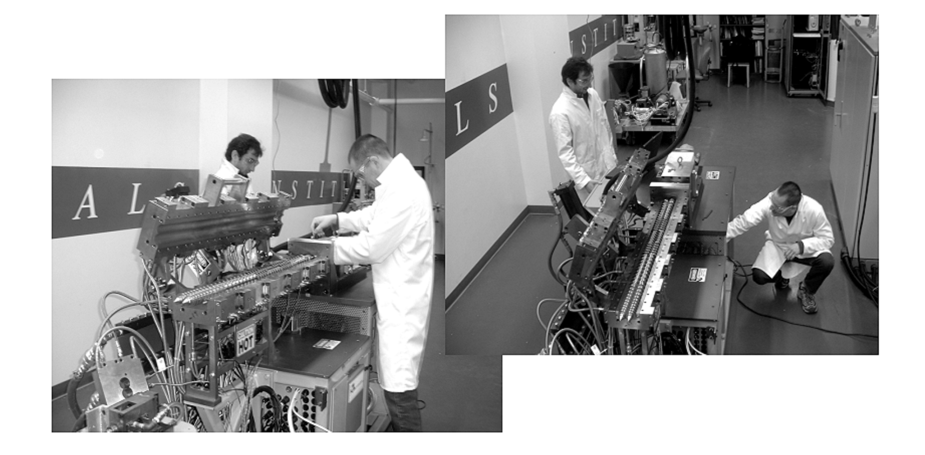
Universal extrusion platform at the counter-rotating mode