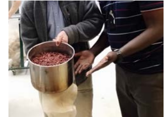
We like beans

External cooker. Storage can be outside and upscaled