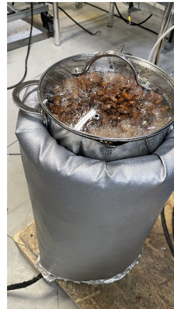
We like beans