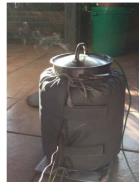
Cooking on Solar Salt latent heat storage