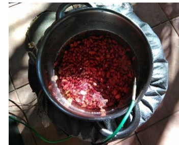
We like beans