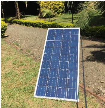
A small PV panel can over time accumulate cooking energy in a heat storage