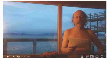
A "naked darwinist" reads his Bioko paper