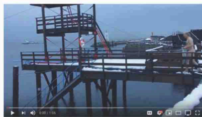
An "aquatic ape" in Trondheim fjord YouTube