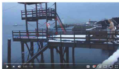
An "aquatic ape" in Trondheim fjord YouTube