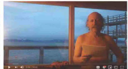
A "naked darwinist" reads his Bioko paper YouTube