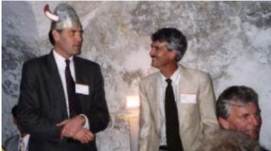
DYCORD conference, Helsingör, Denmark, June 1995.